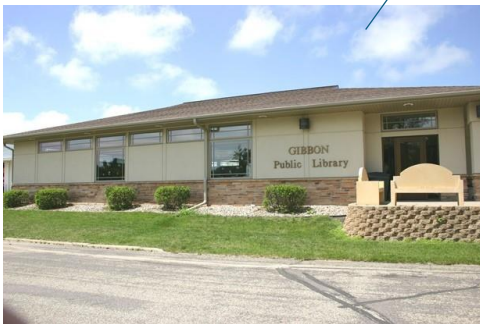
Gibbon Library - 1050 Adams Avenue (between Minnwest Bank and the City Park)